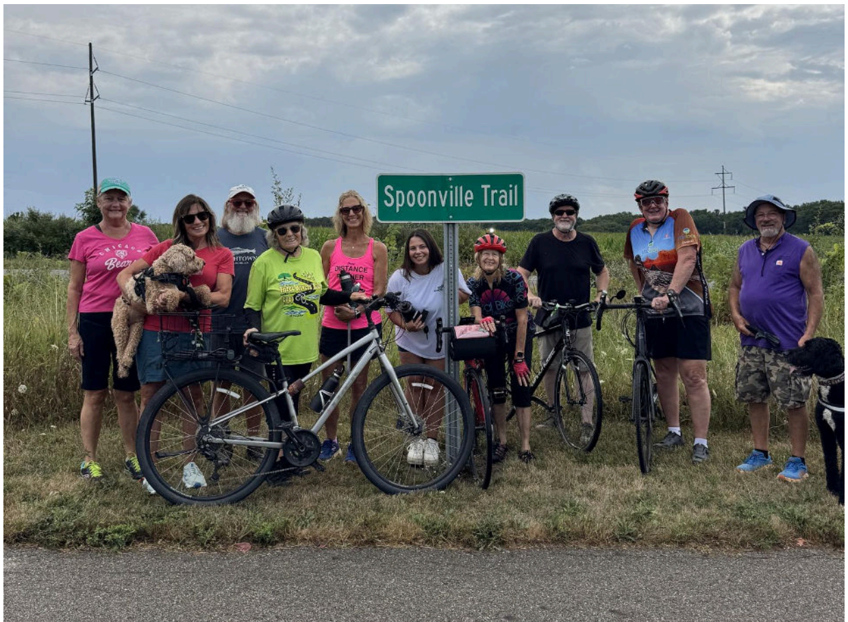
Community members gather during a 2025 West Michigan Trails Meetup on the Spoonville Trail.

Note: There will be excellent photo and video opportunities during the Trail Meetup event including sights along the trail, community connecting and engaging, and interactions with the WMT and B.Healthy Barry County team!